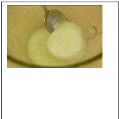
stainless steel spoon.

Slowly add lye to the milk. This can take 10-15 minutes to do properly. Stir constantly. (If you add lye too fast, the lye can burn the milk, causing a scorched smell in your soap.) The lye and milk will heat up to a temperature close to the oil. Completely dissolve the lye into the milk.