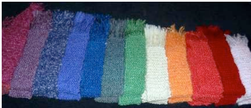
Reiki Wraps for children in hospitals. I used many colors for both boys and girls.

I decided to create the instructions for “Reiki Wraps” and everything you need to know in order to knit and donate scarves for kids; the pattern, materials, the hospital contact letter and person, etc, or to knit them as gifts for friends.